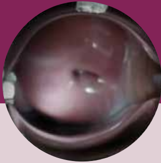
with VuSleeve 1 sidewall tissue retracted