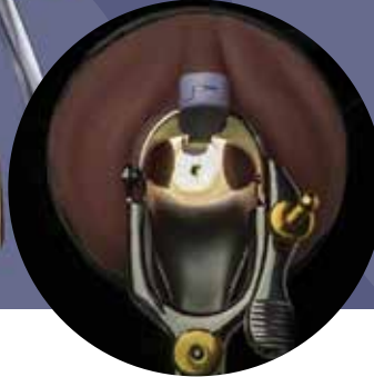
Targeted Illumination Nella VuLight Single Use LED Light