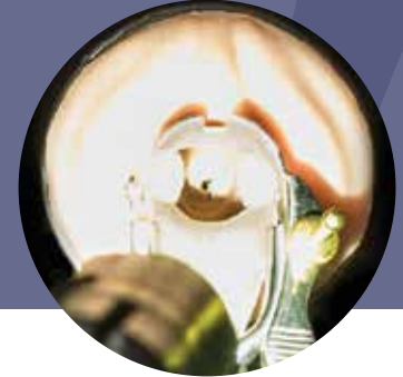
Traditional Illumination Welch Allyn 48810 Exam Light